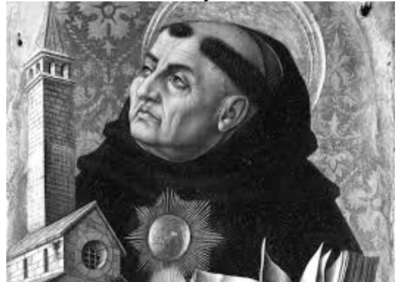
St. Thomas Aquinas January 28 th

Known as the "Angelical Doctor," Thomas of Aquinas was born at his father's Castle at Roccasecca in the region of Aquino, in Italy, on January 28, 1225 of a noble family of the Kingdom of Naples. His father was a Count in the Region of Aquila, which today is in the Region of Lazio, Italy. Despite his family's protest, he was ordained a Dominican Priest.