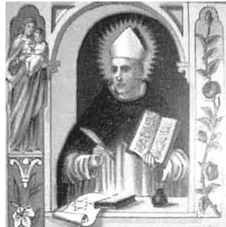
St. Albert the Great November 15

St. Albert the Great is one of the most important intellectual figures pre-dating the early Middle Ages. He was a scholar whose intellect motivated him to study arts and sciences before he received Degrees in both Philosophy and Theology. He is credited to have conducted experiments in Alchemy during which he discovered Silver Nitrate. His study of Astrology impressed upon him the immense reign of the activity of the One True GOD.