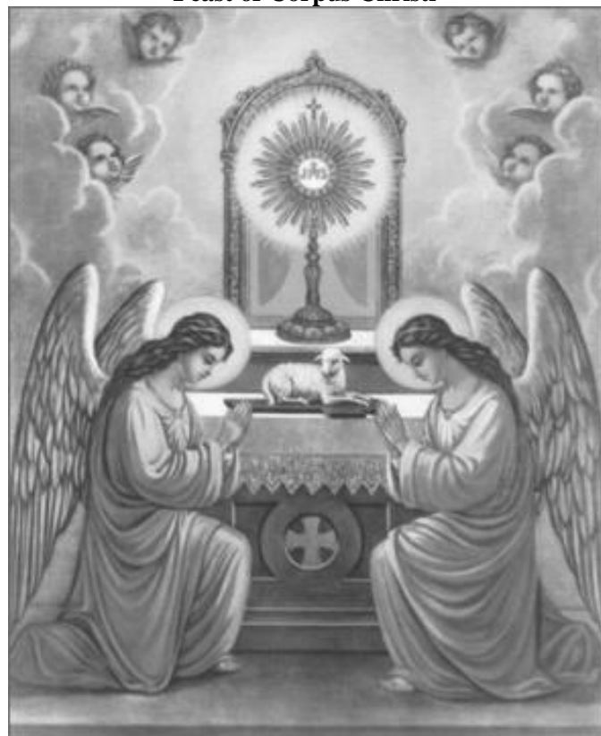
Ave Verum, Corpus Natum Hail, True Body born of the Virgin

Instituted on Holy Thursday during the Last Supper, the Real Presence of Our Lord in the Holy Eucharist is eclipsed by the celebration of the Sacred Triduum & Passion of Our Lord. Hence, it was felt that a separate Feast was necessary.