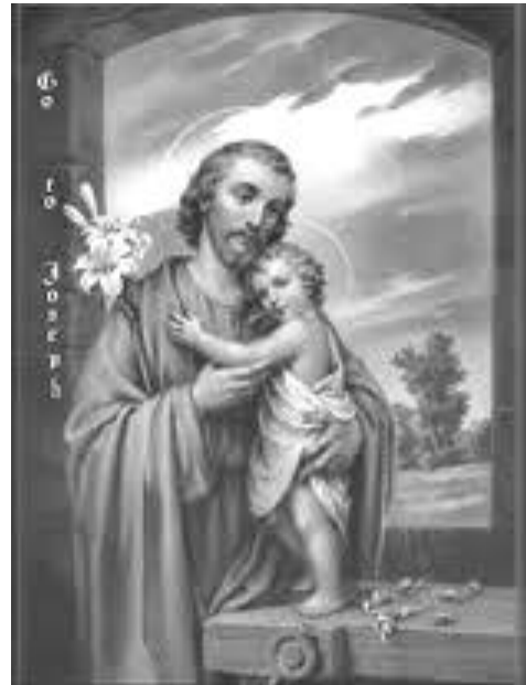
“Joseph” יְהוֹשֻׁעַ - Hebrew renders: “GOD will add.”

St. Joseph is mentioned in the Holy Gospels of St. Matthew and St. Luke as the foster father of the Son of GOD-Our Lord Jesus Christ. Although very little is known about his background, early Christians living in Jerusalem and its environs maintained the Holy Tradition that St. Joseph was a widower who had sired 7 children in his first marriage. After his first wife had died, he remained celibate and worked as a tradesman-a carpenter-who lived in Nazareth.