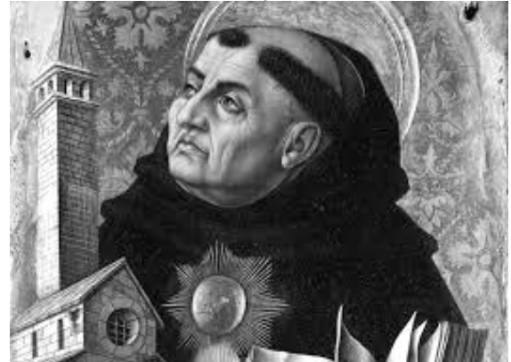
St. Thomas Aquinas January 28 th

Known as the " Angelic Doctor ," Thomas of Aquinas was born at his father's Castle at Roccasecca in the region of Aquino, in Italy, on January 28, 1225 of a noble family of the Kingdom of Naples. His father was a Count in the Region of Aquila, which today is in the Region of Lazio, Italy. Despite his family's protest, he was ordained a Dominican Priest.